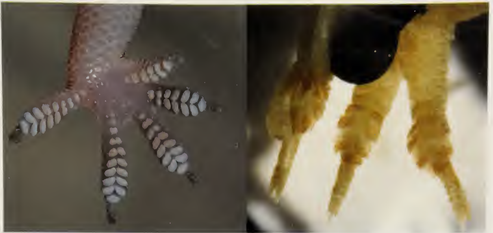
Figure 2. View of left manus of Hemidactylus malcolmsmithi (left panel, CES/11/052 in life; right panel, holotype MCZ-R-3252).

member of the brookii group (Bauer et al., 2010a) or the equivalent tropical Asian clade 1 (Bansal and Karanth, 2010; but see Mahony, 2011 for a consideration that populations in Borneo may have originated from multiple colonizations or from Africa), and the most comprehensively sampled phylogeny from the Indian subcontinent recovered seven divergent clades within the H. brookii complex (Lajmi et al., 2016). Apart from the ground-dwelling clade, which includes five morphologically distinct described species, the H. brookii complex includes H. murrayi Gleadow, 1887, H. parvimaclatus Deraniyagala, 1953, H. treutleri Mahony, 2009, one clade that is morphologically most similar to H. gleadowi Murray, 1884, and two clades allied to H. kushmorensis Murray, 1884 (clade 2 and clade 3 H. cf. kushmorensis ; Lajmi et al., 2016). The type localities of H. gleadowi , H. kushmorensis , H. murrayi , and an H. brookii synonym of uncertain status, H. mahendrai Shukla, 1983, are all in the northern region of the subcontinent. The distribution of clade 3 H. cf. kushmorensis of Lajmi et al.